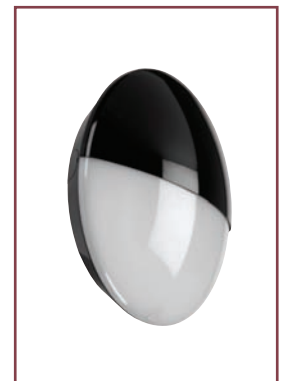
Vienna Round with Eyelid